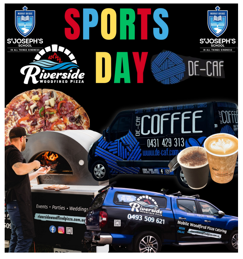
View this article online to read more