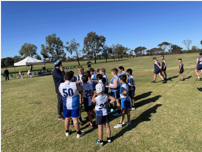
Rocketeers - July Holidays!